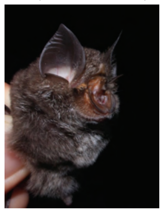
Plate 1: Rhinolophus lepidus