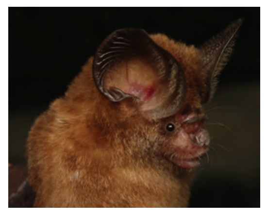
Plate 2: Hipposideros cineraceus