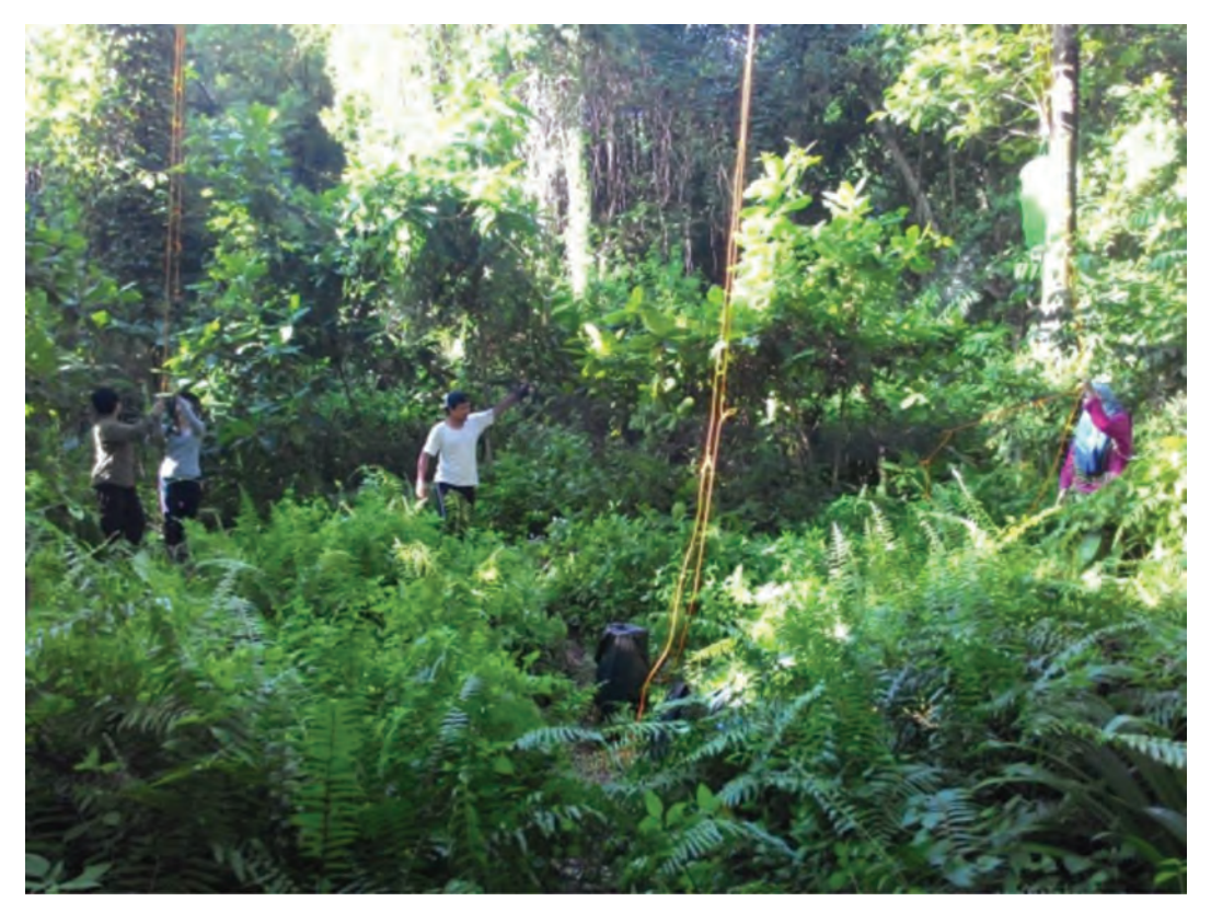
Plate 4: Sub-canopy mist net deployment

J. Sustain. Sci. Manage. Special Issue Number 1: The International Seminar on the Straits of Malacca and the South China Sea 2016: 26-35