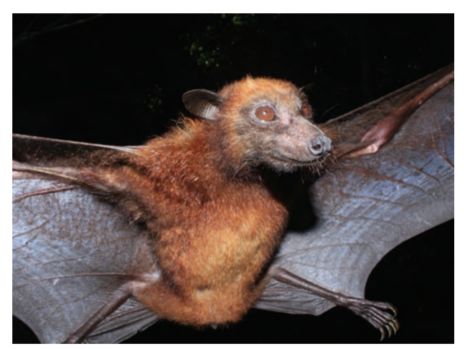
Plate 3: Pteropus hypomelanus