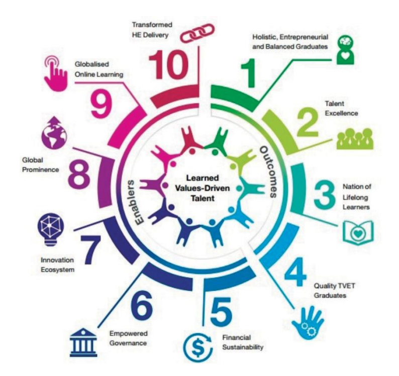
Figure 1: Malaysia Educational Blueprint 2015 – 2025 (Higher Education) (MEB (HE)

The earlier effort on the university living labs involved the research developmentand students involving actively in a project-based approach for the improvement of the campus operations (Evans & Karoven, 2011). How the campus operates in providing a conducive physical environment, green infrastructure and facilities to support the university agenda on sustainability need are needed to consider in developing the campus as a living lab. Meanwhile, the interdisciplinary approach of campus-developed to deploy sustainability affects the approach of research and development to consider during the framework development. Hence, this