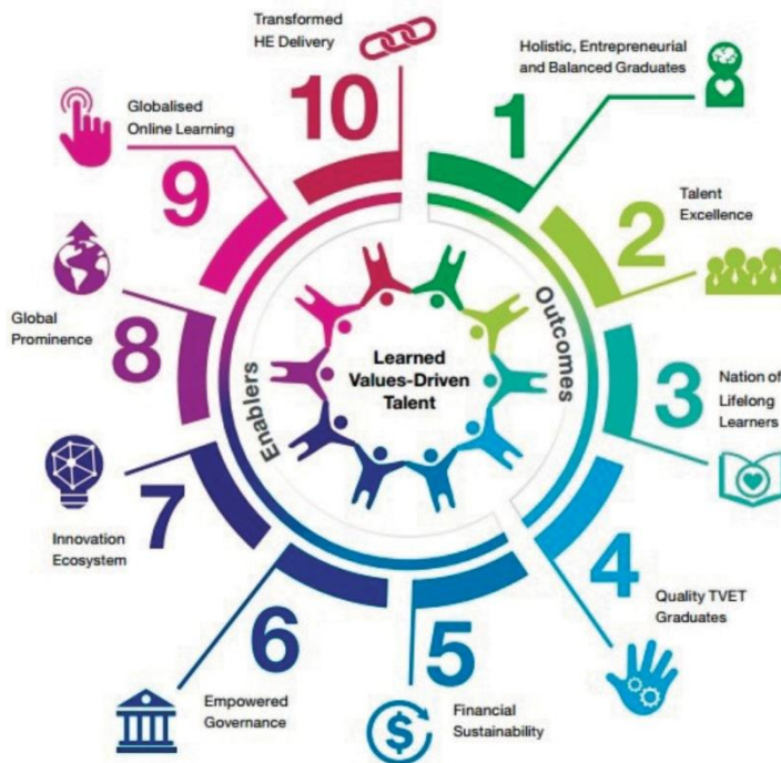
Figure 1: Malaysia Educational Blueprint 2015 – 2025 (Higher Education) (MEB (HE))

The earlier effort on the university living labs involved the research development and students involving actively in a project-based approach for the improvement of the campus operations (Evans & Karoven, 2011). How the campus operates in providing a conducive physical environment, green infrastructure and facilities to support the university agenda on sustainability need are needed to consider in developing the campus as a living lab. Meanwhile, the interdisciplinary approach of campus-developed to deploy sustainability affects the approach of research and development to consider during the framework development. Hence, this