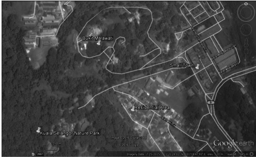
Figure 2: The location of study area