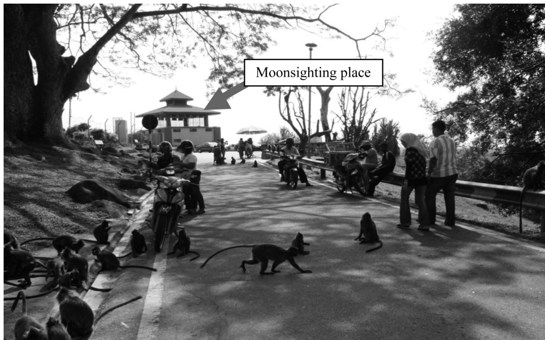
Figure 3: Study group at the moon-sighting site, Bukit Malawati, Kuala Selangor