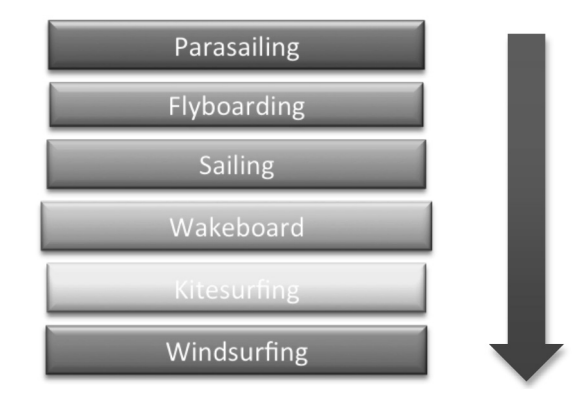
Figure 3: The arrangement from the most potential until the least potential of nautical activities

Based on the results, these three nautical activities are the top potential nautical activities to be held in Terengganu as they provide relevant opportunities to the state in order to sustain the tourism industry. By organising these potential activities, it expects to attract not only the tourists, but also the international water sport associations to join such as The Water Sports Industry Association (WSIA), The Sailing and Cruising Association, Dinghy Cruising Association, Canadian Fly Board Association, International Fly Board Association, etc. By participations of all those associations, it