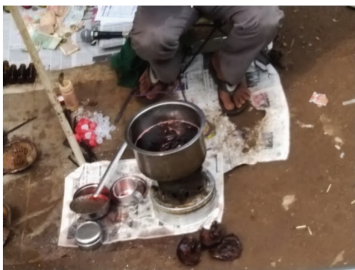
Figure 3: Liberation of horseshoe crab ( Tachypleus gigas ) oil by boiling the carapace

The eggs of T. gigas are green, spherical, protected by a thin elastic euticulablastodermica, encapsulated by a leathery chorion and have nine embryogenesis stages before hatching of the trilobite larvae (Roonwal, 1944). Later, a total of four embryonic moults were discovered for L. polyphemus (Bennett et al. , 1972; Bannon & Brown, 1980) and T. tridentatus , including the hatching that commences after 25-32 days of embryogenesis (Yamamichi & Sekiguchi, 1974; Yamamichi et al. , 1983). Annotations on T. gigas embryogenesis by Chatterji et al. (1996a) reveals that newly fertilized eggs (size 3.57 mm and weight 24.17 mg; Stage A), rupturing of chorion that enlarges the egg to 3.86 mm (Stage C; Moults 1), separation of leathery chorion after swelling of euticulablastodermica by perivitelline fluid build-up (Stage D; Moults 2), embryonic cleavage for vasculogenesis (Stage E; Moults 3), embryo weighs 138.02 mg and has movable legs (Stage F) and hatching of trilobite larvae that measures 6.99 mm and weighs