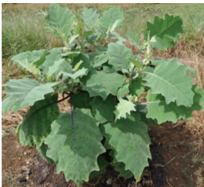
(A) Whole plant

Besides commonly used as a vegetable by the local communities, the Dayak people use this plant to treat pinworms (AsianItinerary, 2013). Despite S. lasiocarpum Dunal's commonness and nutritional value, its biological properties are still under study. Exploring S. lasiocarpum Dunal usefulness will widen botanical information, scope of fruit consumption and its applications. This article reviews the phytochemical composition and biological properties of the S. lasiocarpum