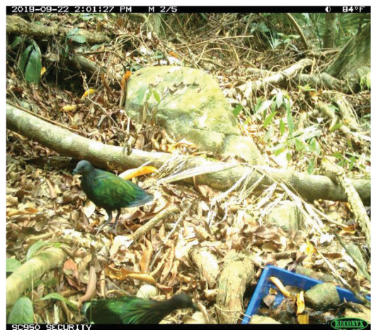
Figure 2: Nicobar pigeon ( Caloenas nicobarica )

( Nisaetus cirrhatus ), White-bellied sea eagle ( Haliaeetus leucogaster ), Grey-headed fish-eagle ( Ichthyophaga ichthyaeetus ) and Nicobar Pigeon ( Caloenas nicobarica ). Nicobar pigeon was an important finding in this survey. They were captured by a camera trap in September when the weather was turning from dry to wet season before the monsoon. In Figure 2 (right), three individual species were captured in one camera with a total of 20 captured pictures. Nicobar pigeons were photographed foraging in groups on Mount Semudu. The picture of the Nicobar pigeon was captured on 22 September 2019, 1400 h.