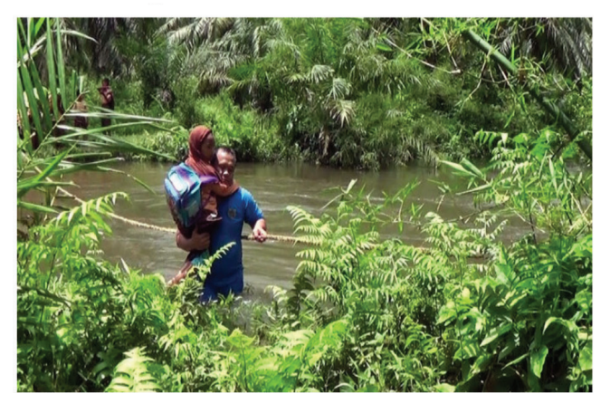
Figure 5: The child who is crossing the river