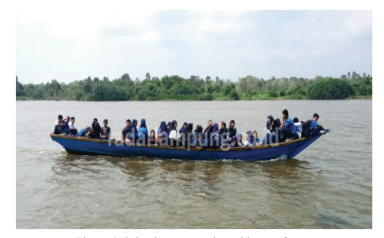
Figure 4: School transportation without safety

The conditions for children are difficult because of the poor infrastructure and the lack of public transportation in the plantation areas where they live. However, if the flow of the Mahuam River increases and the current becomes heavy, some families will help dozens of these children cross.