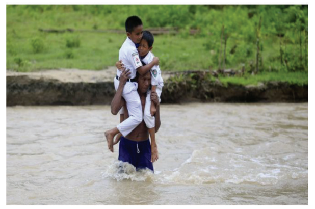
Figure 6: These children who are crossing the river

The Dutch heritage bridge, which also functions as a water channel, is used by residents to shorten the distance to 8 km. Topic 9, In Kampung Sajang, East Lombok Regency, West Nusa Tenggara, lives in the middle of a forest at the foot of Mount Rinjani. The distance between school and home is about three kilometres. However, this distance must be reached by passing a path with the road's contours going uphill following the ridge of the hill. They must pass through forests and rivers with a width of about 50 m via a self-supporting bridge. Children's safety is especially worrying during heavy rains. Inequality in Indonesian Archipelago between urban children can attend school comfortably. Many children in rural areas struggle to go to school every day. Urban life is accustomed to various facilities, although traffic and pollution are their main problems. Physical and psychological security guarantees by the government and cities in the archipelago have not been fulfilled. No safe transportation system is available, and children move independently in environments that risk their safety. Participatory research child-friendly environments on consistently finds overarching themes across