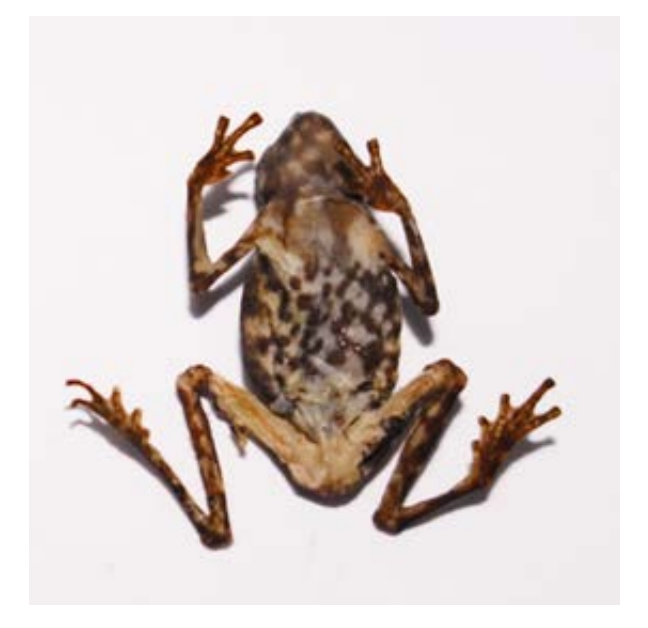
Figure 3: Ventrolateral view of P. api (female).