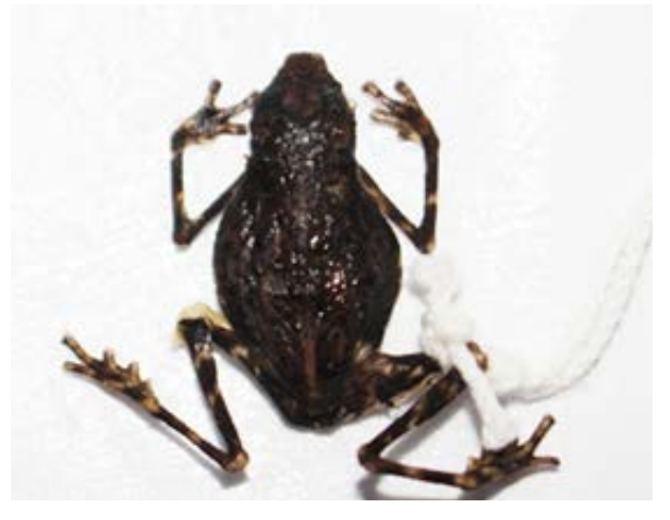
Figure 2: Dorsalateral view of P. api (female).

nostrils much closer to snout-tip than to eye; the canthus angular (curved), tympanum distinct. In addition, the individuals found also have slender fingers with bluntly rounded tips; fleshy palm web. Their dorsum are covered by small rounded tubercles (weakest in mid-dorsal region), throat wrinkled, no spinules on belly. When alive, their colours of dorsum were black with restricted pale areas; limbs with pale, broken cross bar dorsally.