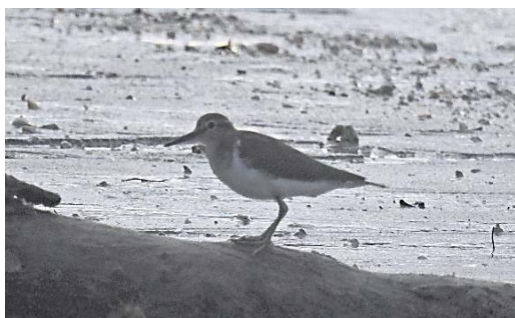
c. Common Sandpiper