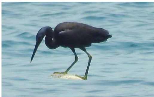
a. Pacific Reef Egret