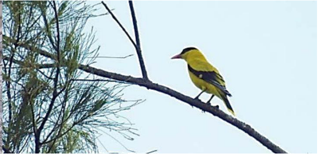
j. Black-naped Oriole