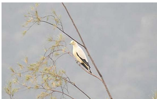
g. Pied Imperial Pigeon