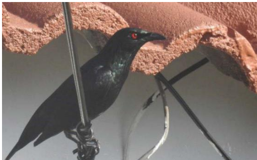
k. Asian Glossy Starling