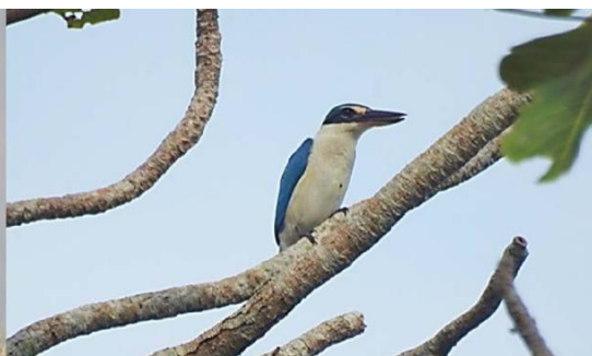
h. Collared Kingfisher