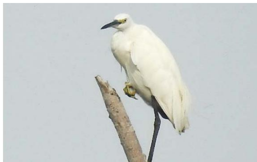
b. Cattle Egret