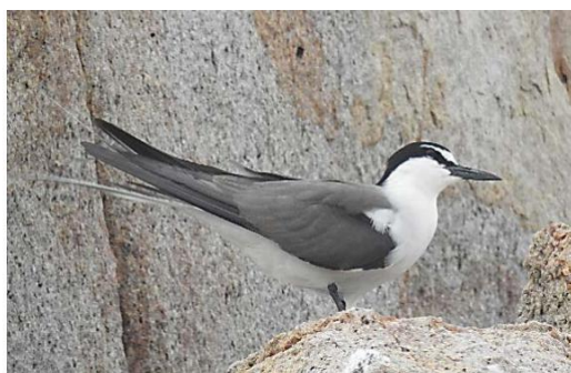
f. Bridled Tern