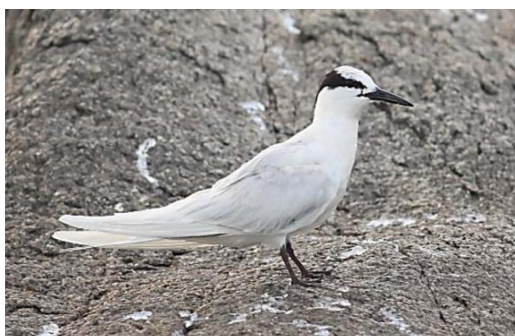
e. Black-naped Tern