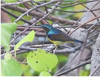
i. Olive-backed Sunbird