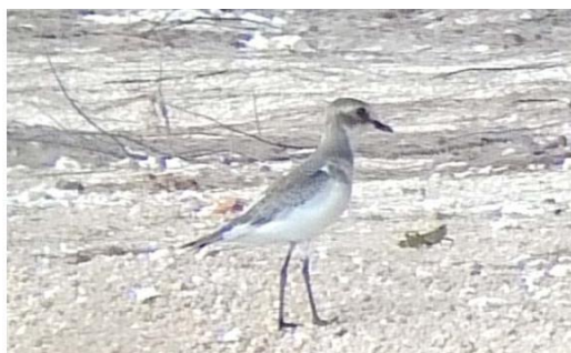
d. Greater sand plover