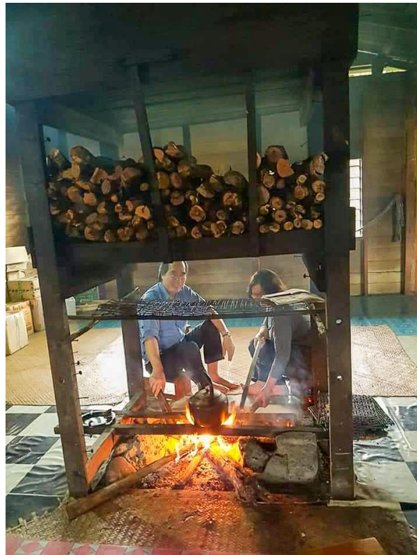
Figure 2: A hearth (fireplace) in a home in Bario