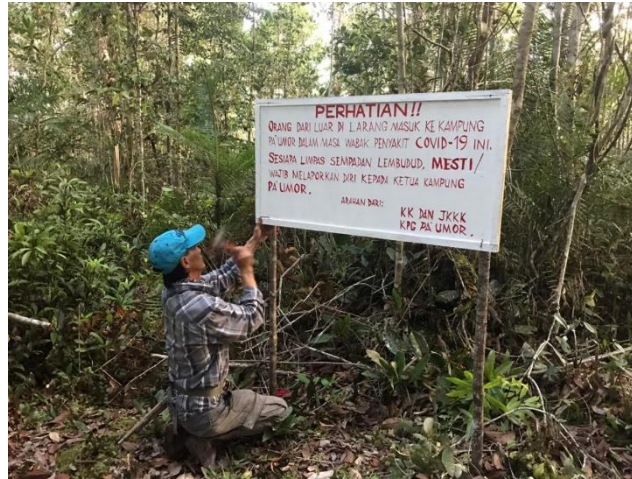
Figure 3: Sealing off the village