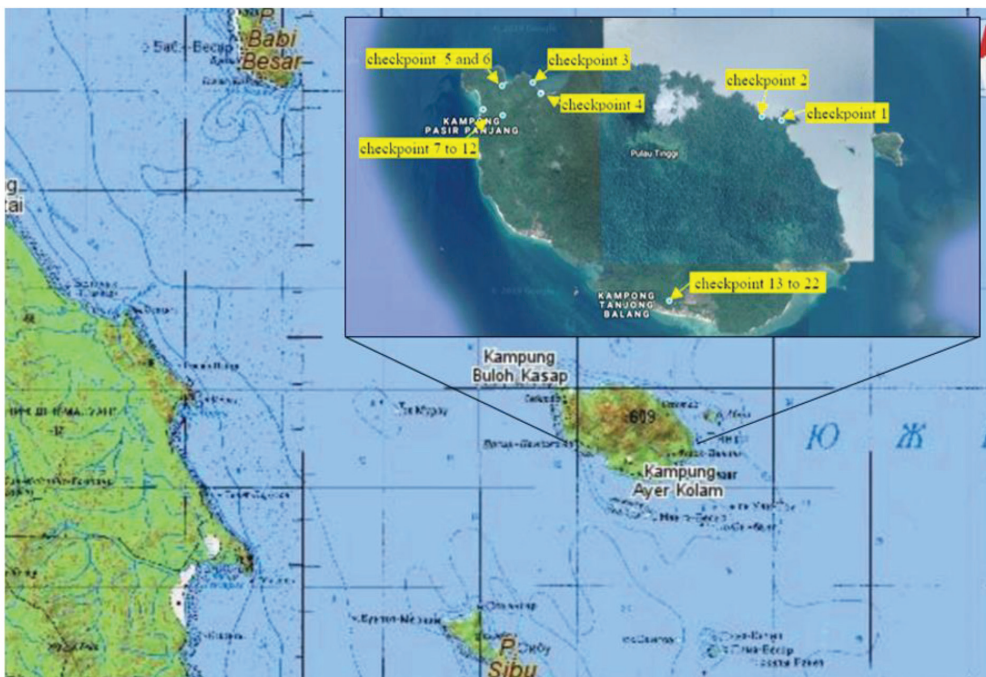
Figure 1: Map of Pulau Tinggi and camera trap checkpoint

The study areas were focused on Sebirah and Gunung Semudu of Pulau Tinggi (Figure 1). Both localities were less studied as most previous studies focused on the mainland or other bigger islands that were considered isolated (Ricketts et al. , 2005; Loehle & Eschenbach, 2012). However, Pulau Tinggi is unique compared to other surrounding islands, where the island is one of the largest islands in the East Johor Island Archipelago; this impassioned the researcher to have an in-depth investigation. The summit of the hill is up to 610 m (Ibrahim et al. , 2019) and the total area of the island is 16 km 2 . The weather on this island is hot and humid throughout the year (Department of Marine Park Malaysia, 2012). Low logging activity preserves the inner part of the island, maintaining the primary forest with a dense canopy (Azman et al. , 2008). Figure 1 shows the location of Pulau Tinggi and each camera trap with checkpoints 1 and 2: Teluk Siam checkpoints 3 and 4: Kampung